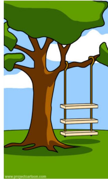
How the customer explained it