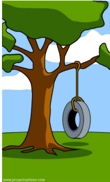
What the customer really needed