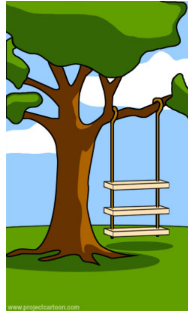
How the customer explained it